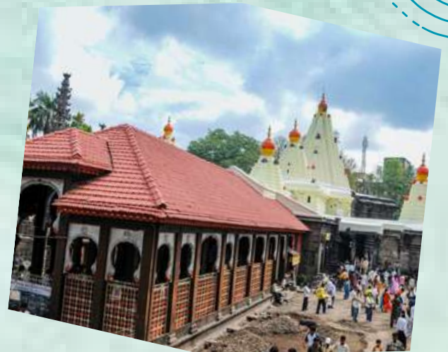
Mahalaxmi Temple, Kolhapur 6th Century Stone Architecture