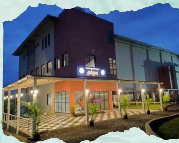
Anandbhavan Auditorium - CSIBER

The National Assessment and Accreditation Council (NAAC), Bangalore, Ministry of Education, Government of India has reaccredited the Institute and conferred 'A+' Grade in the 4th cycle. The University Grants Commission (UGC), Government of India conferred "College with Potential for Excellence (CPE)" status from the year 2006 to 2021.