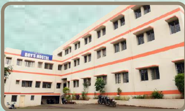
Boys Hostel - CSIBER