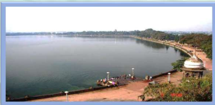
Rankala Lake of Water Sustainability - Kolhapur