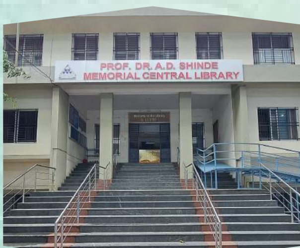
100,000+ Books treasure Central Library- CSIBER