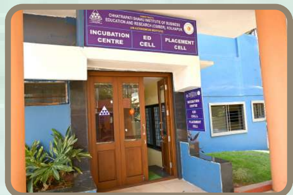
Entrepreneurship Development Cell- CSIBER