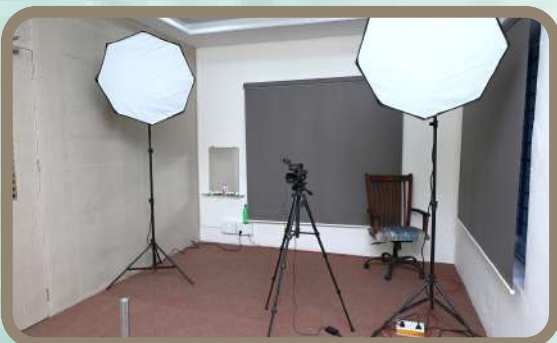
Audio Visual Studio

Former Director General Incharge, Professor of Management University of Technology, Mauritius.