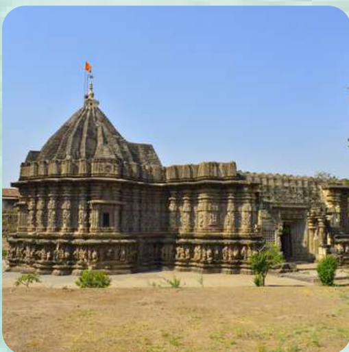
Kopeshwar & Dhopeswar Temple, Khidrapur at 60 kms. Distance from Kolhapur, 6th Century ADE Stone Heritage