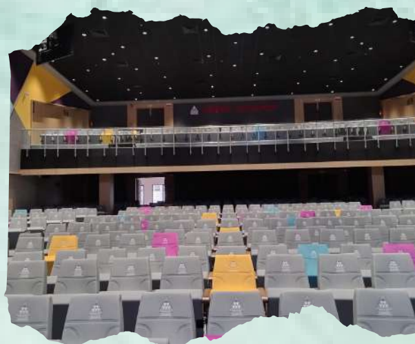
900+ Seating capacity Auditorium Interior