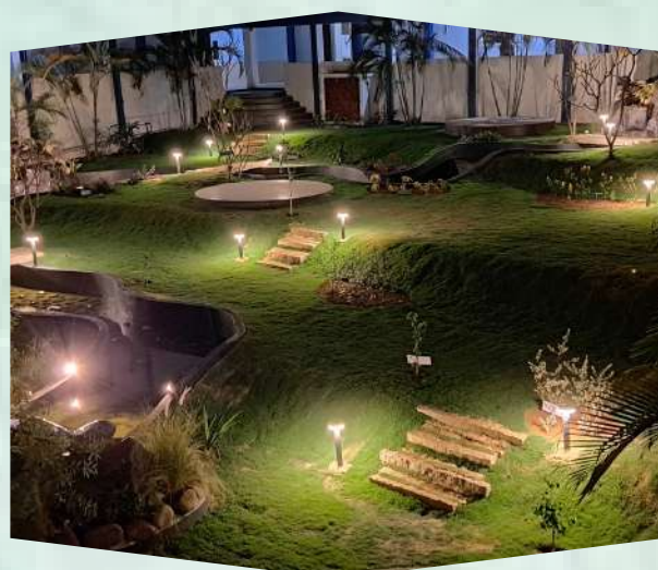
Sunken Garden - CSIBER