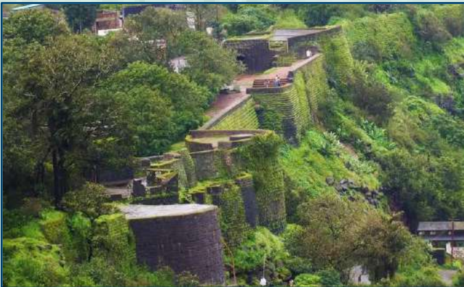
Panhala Fort at 20 kms Distance from Kolhapur 12th century Fortified Settlement