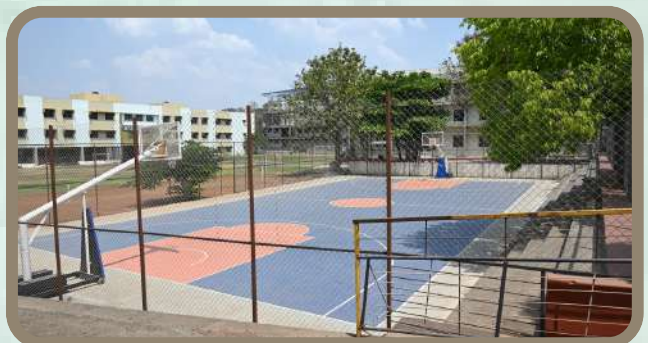
Football & Basketball Ground