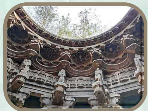
Kopeshwar & Dhopeswar Temple Moonlight Mandap