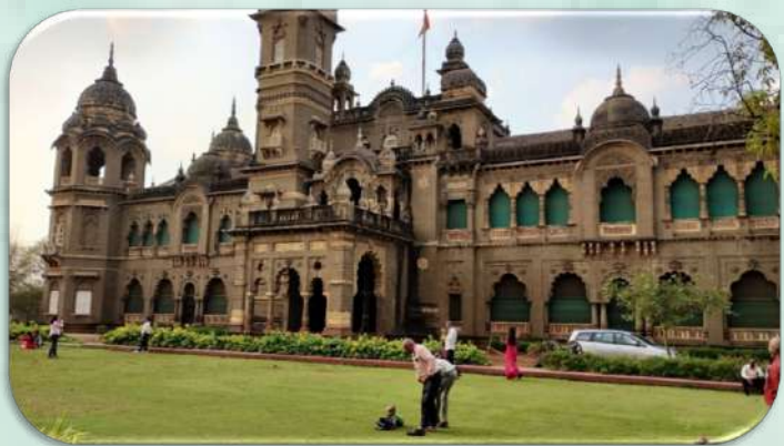
New Palace, Kolhapur