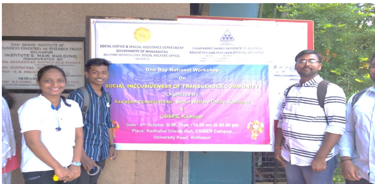
One Day National Workshop on Social inclusiveness of Transgender Community

Social work faculties and students regularly conduct field visit to identify their problems and organize programs to integrate them with society in general.