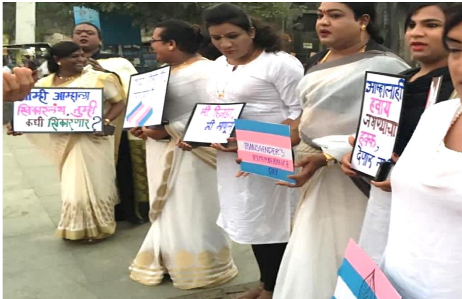
Standing with Transgender Community